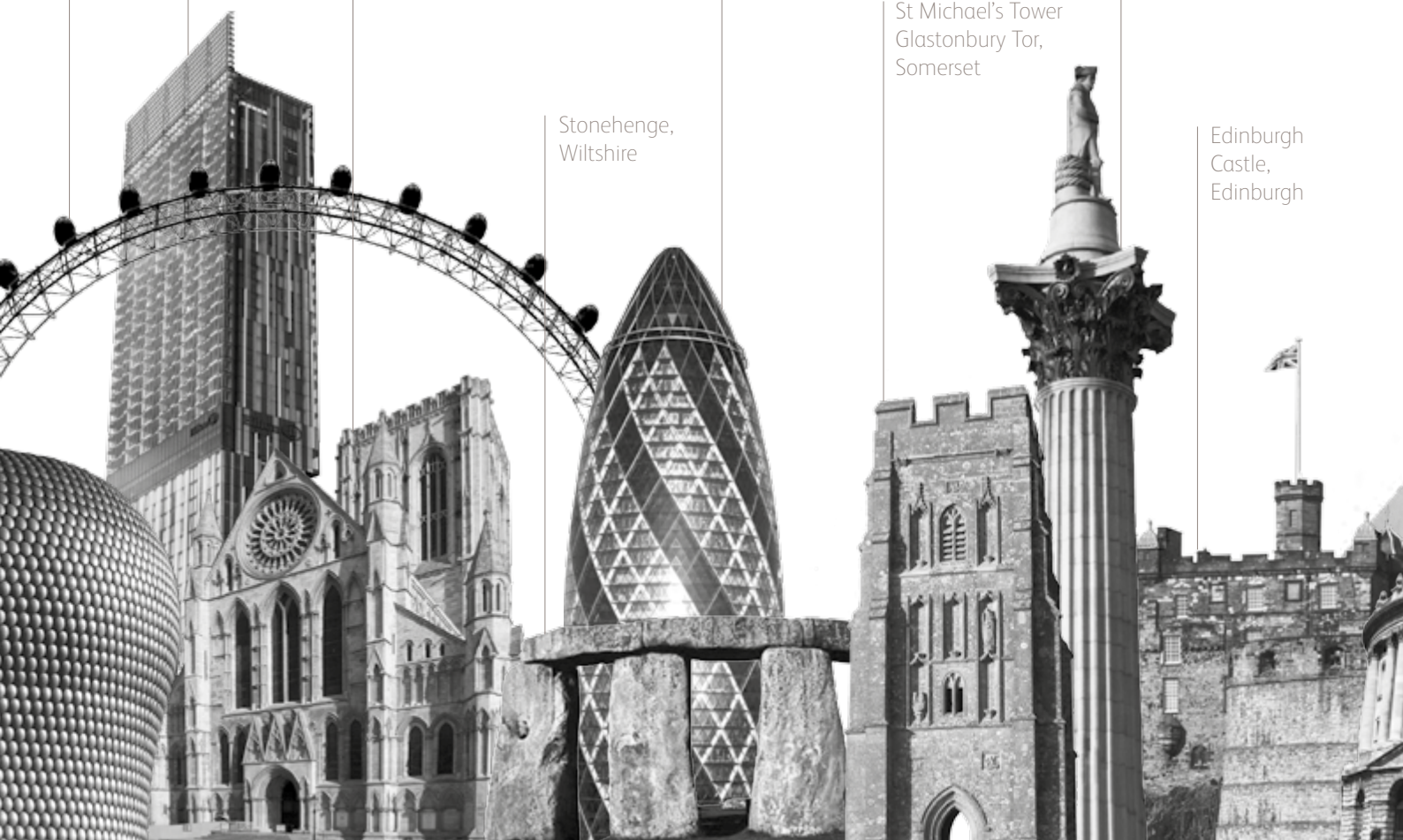
Edinburgh Castle, Edinburgh